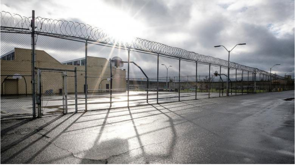
Oregon State Penitentiary in Salem.

beat the hell out of me and lock me up (in solitary) for no reason.”